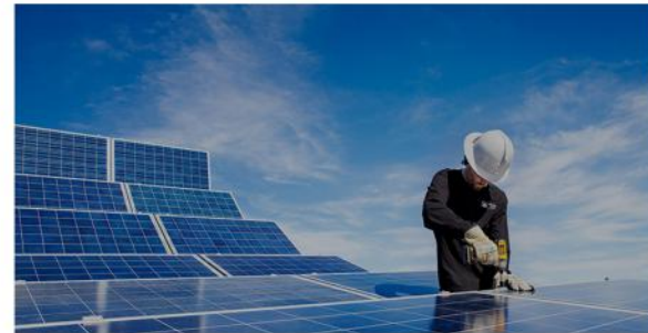
Commissioning and maintaining . . .