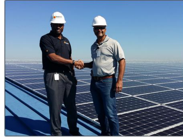
Contracting . . .

ÖZGÜN GRUP acts as a sub-contractor at large scale solar projects wherever in the world, where the Company will self perform the electrical, mechanical, civil and commissioning works while maintaining high H&S standards, meeting tight deadlines and preserving the quality of works.